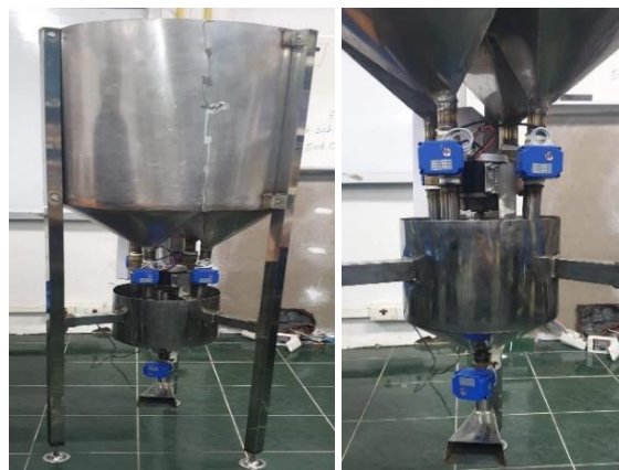
Figure 3. A prototype platform

In this section, the proposed prototype platform on two folds is analyzed. The first fold is the functional test by adjusting the sensor servo speed. The second fold is machine performance test. Figure 3 shows a prototype platform for automated chicken feeding control with an embedded system.