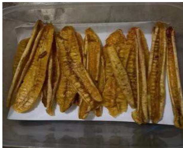
Fig. 6 1 hour irradiation

Figure 6 shows the drying result of sale pisang with UVC lamp irradiation for 60 minutes or 1 hour. This sale pisang has a soft and chewy texture compared to sale pisang with UVC lamp irradiation for 30 minutes.