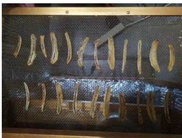
Fig. 3 Irradiation without UVC lamp

Table 2 shows the percentage of moisture content contained in the sale pisang. This moisture content is obtained after drying for 5 hours and 30 minutes. The duration of irradiation is directly proportional to the percentage of moisture content. The longer the irradiation of UVC lamps, the greater the moisture content contained in sale pisang. This happens because UVC irradiation affects the permeability of banana tissue. Permeability is the ability of tissues to pass a certain substance, in this case, water. The irradiation of UVC lamps causes the space between cells to shrink so that water loss is smaller [22], [23].