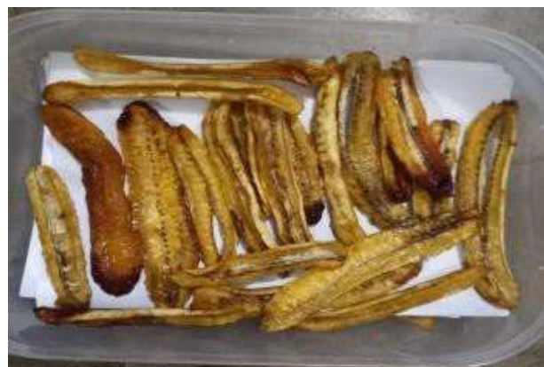
Fig. 5 30 minutes irradiation