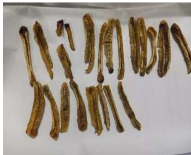
Fig. 4 15 minutes irradiation

Figure 5 shows the drying result of sale pisang with UVC lamp irradiation for 30 minutes. This sale pisang has a softer texture and is quite soft compared to sale pisang with UVC lamp irradiation for 15 minutes.