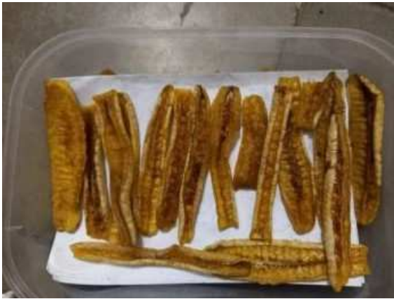
Fig. 7 2 hour irradiation

Based on the test, sale pisang with 1 hour of UVC lamp irradiation produced a good texture, soft, not too dry, and not too soft. This is because 1 hour of irradiation produces good water content and sugar content for the caramelization process.